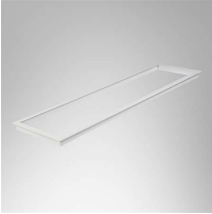
Concealed Ceiling Frame 300x1200mm.